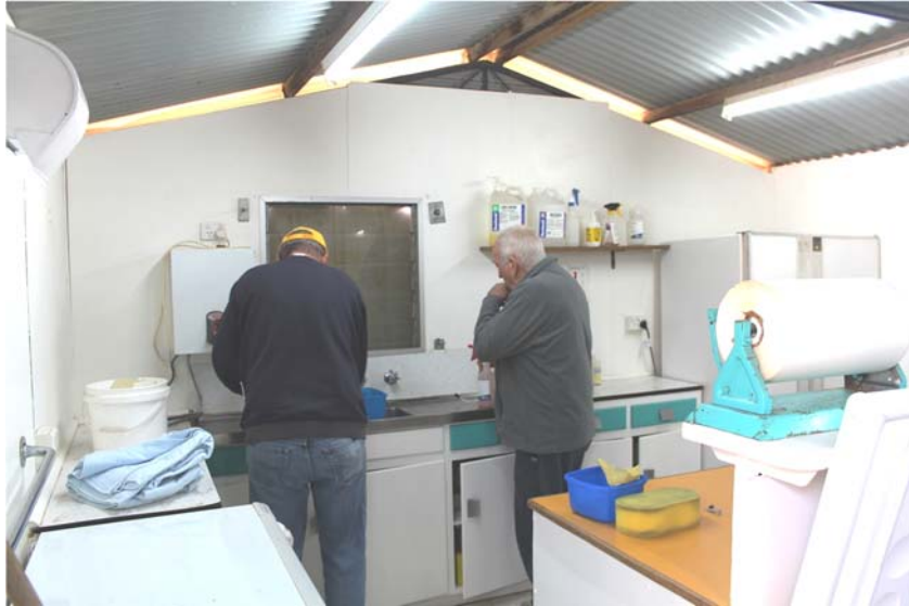
Cleaning Dutch Shed