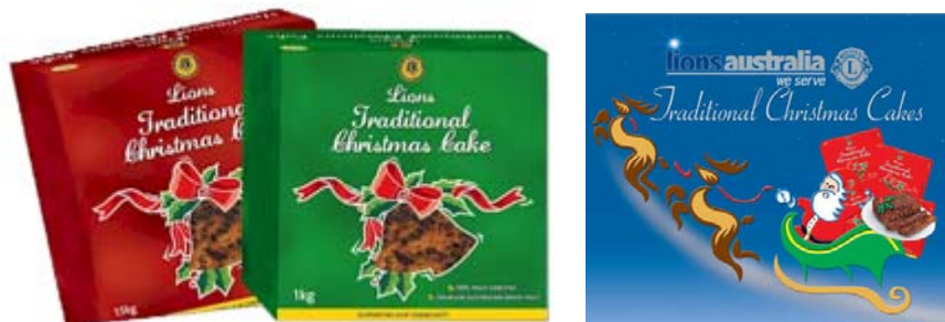
Lions Christmas Cakes - 1kg & 1.5kg