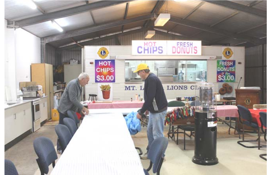
Preparing Carpys Cubby