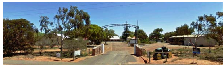
Mount Laura Homestead - National Trust Museum